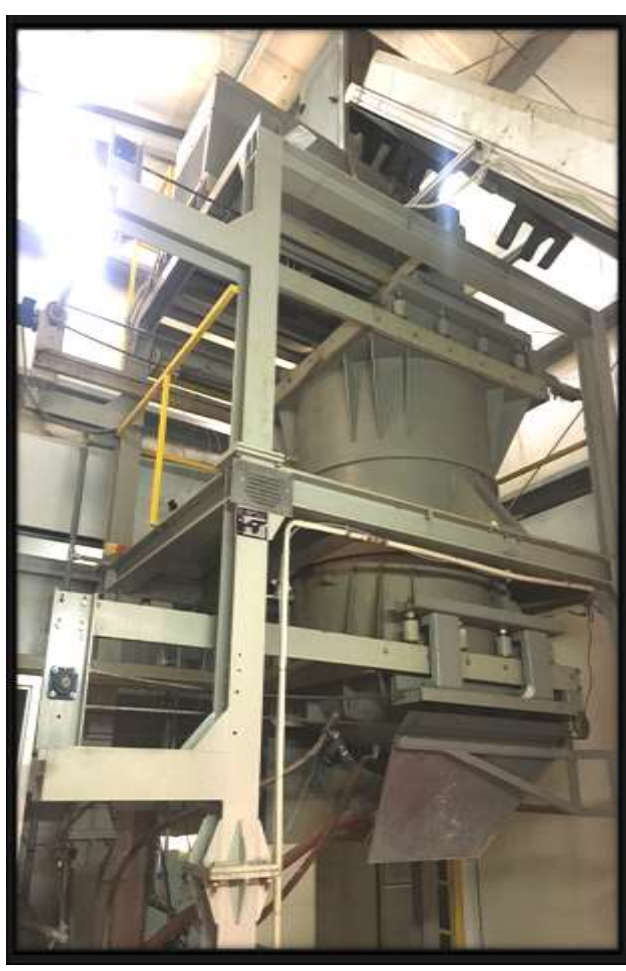
Plate 1. Medical solid waste treatmentautoclave uses AL- Kadhimiya and Al-Yarmouk teaching hospitals