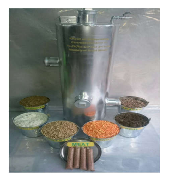
Figure 1:Tank and raw materials used in the compositing Process.

The bioreactor tank was designed to contain 59.2 kg of mixed organic solid waste. The tank was 45 cm in diameter, 130 cm total height and a 0.2 cm wall thickness. The tank was provided with false bottom made of perforated steel plate about some 3 inches above the bottom of the tank. Thus, a clear space was provided for catching any drainage liquor, or for introducing air as shown in Fig.1.