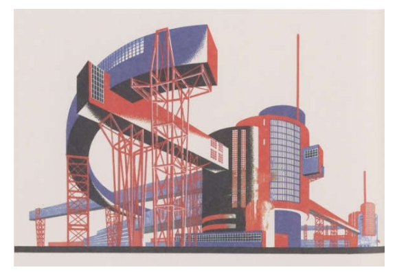
Figure 3: some of Constructivist architecture thoughts

The residential complex in Novgorod, Moscow 1928 - 1930, by Ginzburg 1892-1946 is a pioneering experience in this field. [15].