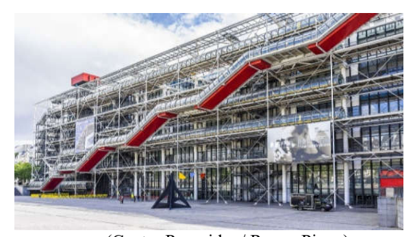
(Centre Pompidou/ Renzo Piano)

High-Tech is characterized by its eagerness to highlight the advanced technical feature in which the functional uses of the structures and the engineering services system are transformed into expressive elements, with exaggeration in their importance and size. [High -Tech] also aims to realize and understand the aesthetic of metal structures (iron) with glass panels, in addition to introducing elements of engineering services such as ventilation pipes and sewerage services in an effective way in the design treatments of the buildings carried out according to their proposals. [13]