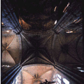
Figure 1: shows the operation of force transmission and its effect

Nervi defines creation in structure as "True structure" which is characterized by the aesthetic satisfaction. As it's mentioned that recipients accept these forms instinctively, although they cannot fully understand the complex laws of structural mechanics.