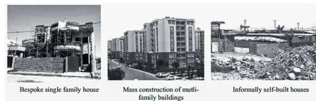
Figure 1: Shows the lack of management in meeting the needs of housing. Source: (Al-Hafith et al., 2018).

Several interrelated factors complicate Iraq's housing crisis. Such factors include unclear property rights and inefficiency in land management (Al-Hafith et al., 2018), see Fig.1. Additionally, high cost of construction deteriorated by shifting raw material prices and shortage of skilled labor as indicated by Mallooki et al. (2022). Further still, inadequate access to housing finance limits the purchasing power of low- and middle-income households (Alanizi et al., 2022). Furthermore, due to lack of an integrated urban planning system urban sprawl has been witnessed in a disorganized manner resulting in overstretching existing infrastructure and public service (Al-Essawi, 2018).